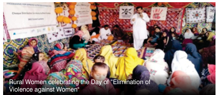
Rural Women celebrating the Day of "Elimination of Violence against Women"

LSO Moen Jo Daro along with LSO Sindhu Darya organised a workshop to celebrate the day of "Elimination of Violence against Women". More than 100 women community leaders from different LSOs participated in the workshop and shared their experience regarding their struggle to raise awareness among rural women about their basic rights. The women community leaders delivered speeches and highlighted the types and means of violence against women in rural areas by referring to their personal experiences, and proposed practical solutions to uproot the problem. They suggested that both men and women should be given awareness about the root cause of violence against women, its adverse effects on the tortured women, family members, children, and the larger society. The women leaders of the community institutions pledged that they will try their best to eliminate violence against women in the organised households under their LSOs. All participating women marked their handprints on a banner to symbolise the saying "Stop Violence against Women".