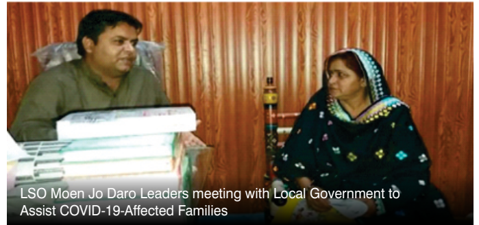
LSO Moen Jo Daro Leaders meeting with Local Government to Assist COVID-19-Affected Families

A key role of an LSO is to develop and maintain linkages with Government Departments, NGOs and stakeholders to access their services and resources for the development of its members. During the lockdown to contain spread of COVID-19, a significant number of poor families were adversely affected due to loss of jobs, daily labour and other sources of income. In this regard, LSO Moen Jo Daro conducted meetings with representatives of local government at Union Council and taluka level and briefed them about these economic hardships and requested for support from Government resources. The LSO leaders also listed extremely needy households to the Government representatives for provision of food ration. The Government nominated leaders of LSO Moen Jo Daro as the members of Relief Committees formed at taluka level under the instructions of the District Government. The LSO Leaders nomination deserving households from their UC area to the Assistant Commissioner of respective talukas, and also played a role in the monitoring of food ration distribution in different areas. As a result of these coordinated efforts, maximum deserving households received ration bags from Government sources.