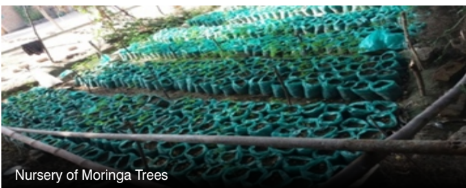
Nursery of Moringa Trees

Under the EU funded SUCCESS Programme, the LSO engaged CRPs to deliver awareness sessions regarding various cross-cutting themes, including the benefits of tree plantation at the village level. Through these sessions, they learnt that trees play an important role in the lives of rural communities. They provide shade for people and animals, fodder for domestic animals and fruits for household consumption as well as sales. Therefore, the LSO Leaders decided to do tree plantation through its CO members and planted 500 trees in collaboration with the Natural Resource Management (NRM) section of SRSO.