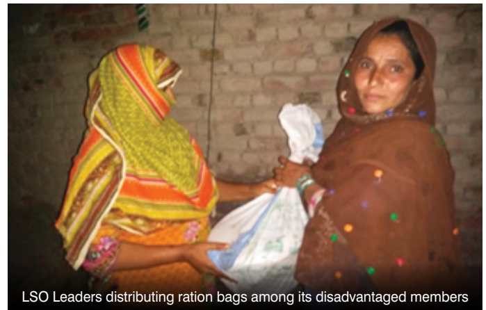
LSO Leaders distributing ration bags among its disadvantaged members

The Leaders and Community Resource Persons (CRPs) of LSO Moen Jo Daro received training on awareness raising about precautionary measures against COVID-19 from the Government health staff. They conducted awareness sessions among LSO members and educated them about the severity, symptoms and preventive measures of COVID-19. They conducted such sessions in 74 Community Organisations (COs).